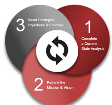
Step 1: Complete a Current State Analysis/OrgScan™

Understanding your current state is the first step in conducting an effective strategic meeting. Give your team pre-work and expect them to think through the strengths, weaknesses, opportunities, and threats to form a SWOT analysis. After your team has examined and prioritized its SWOT analysis, you'll need to engage your team in a discussion of the: